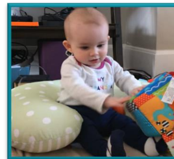
A seating pillow helps prop up a child to be upright during an activity.