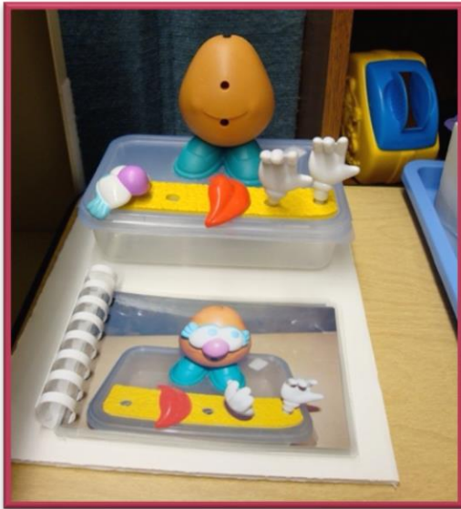
Mr. Potato Head with a picture for instruction and limited attachments/choices to complete the activity.