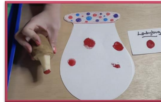
A potato carved to a rounded point to use as a paintbrush with a larger grip.