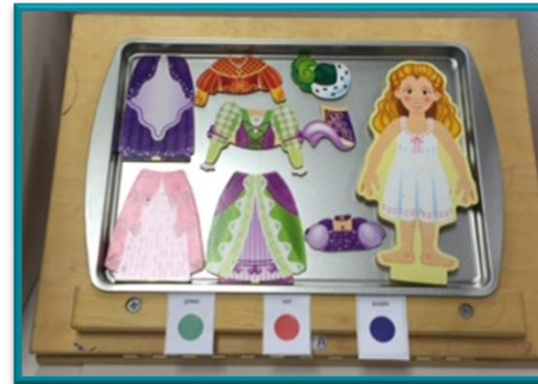
An example of stabilize it a doll and clothing stabilized on a cookie sheet with magnetic strips added to the back.