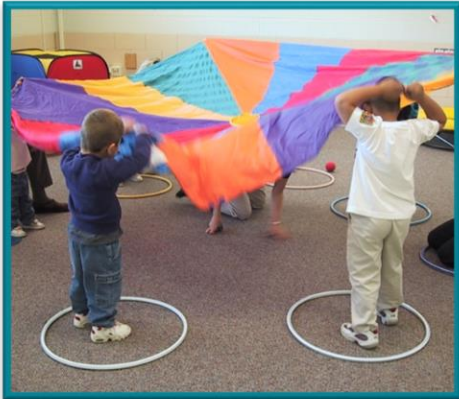
Hula hoops during parachute activity provides a visual reminder to move in their area.